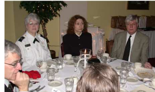
SHPS 2007 Change of Watch at Peter's Place