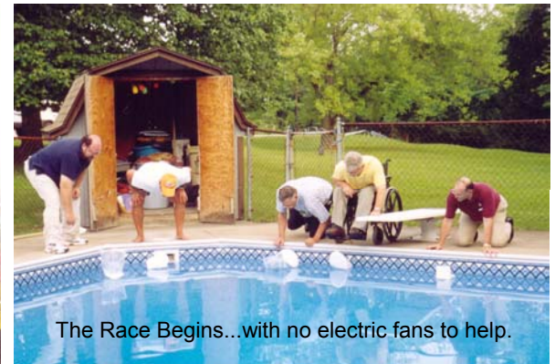
The Race Begins...with no electric fans to help.