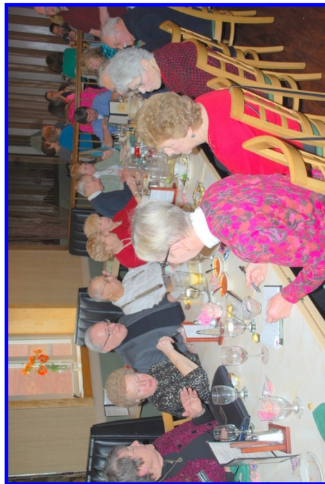
Everyone enjoyed a pleasant afternoon meal at the SHPS After Christmas Party.

P/Stf/C Donald Stark, JN, Co-Editor 65 Stark Spur Eighty Four, PA 15330-2547